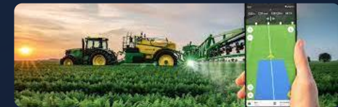
Construction & Agriculture