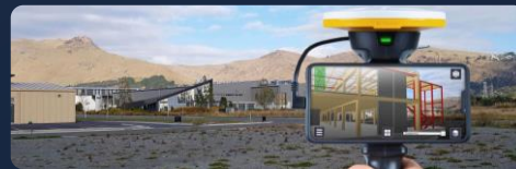
Mobile Location & AR